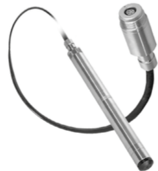
Version DCX-22SG DCX-22VG