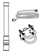
1 × 60cm LoRaWAN ® Fiber-Glass Antenna Kit (Optional)

*Note: Contact us if you need any other special accessories or customized accessories.